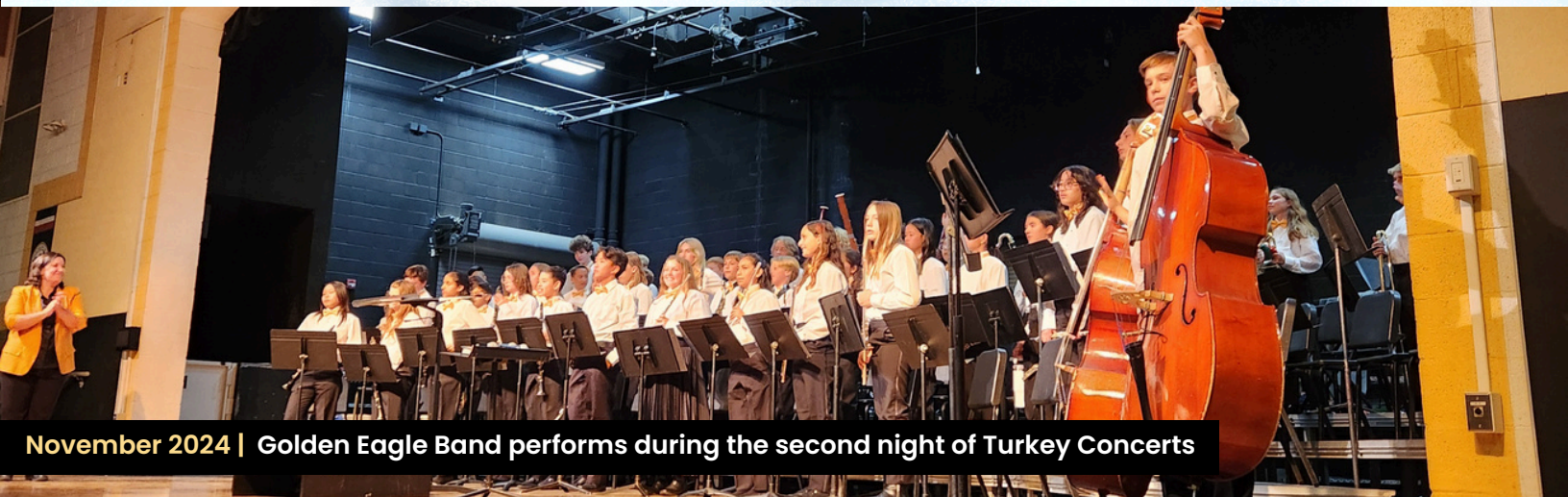
November 2024 | Golden Eagle Band performs during the second night of Turkey Concerts

Official Newsletter of SEMS Music Program Boosters