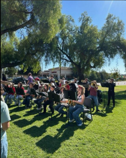
Gig Jazz Band performs at the City of San Marcos Veterans' Day Ceremony