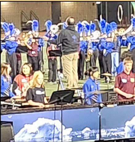
SEMS 8th grade musicians perform with the San Marcos High School Marching Band at their season finale show